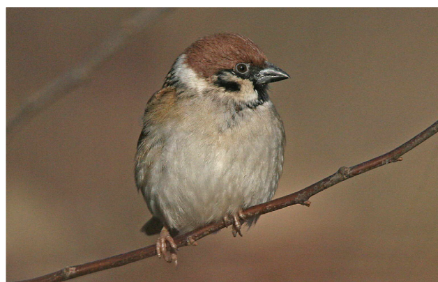
Tree sparrow