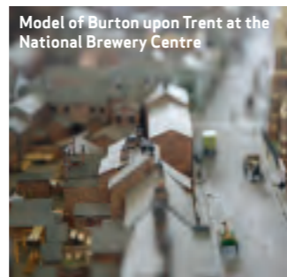
Model of Burton upon Trent at the National Brewery Centre

Snibston's colliery tours reveal mining memories. It also houses the largest fashion gallery outside London reflecting the importance of Leicestershire's textile industry.