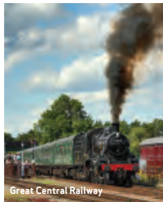
Great Central Railway

Next stop is the award-winning heritage railway, The Great Central , where you can take a train ride, explore the stations and get up close to the engines.