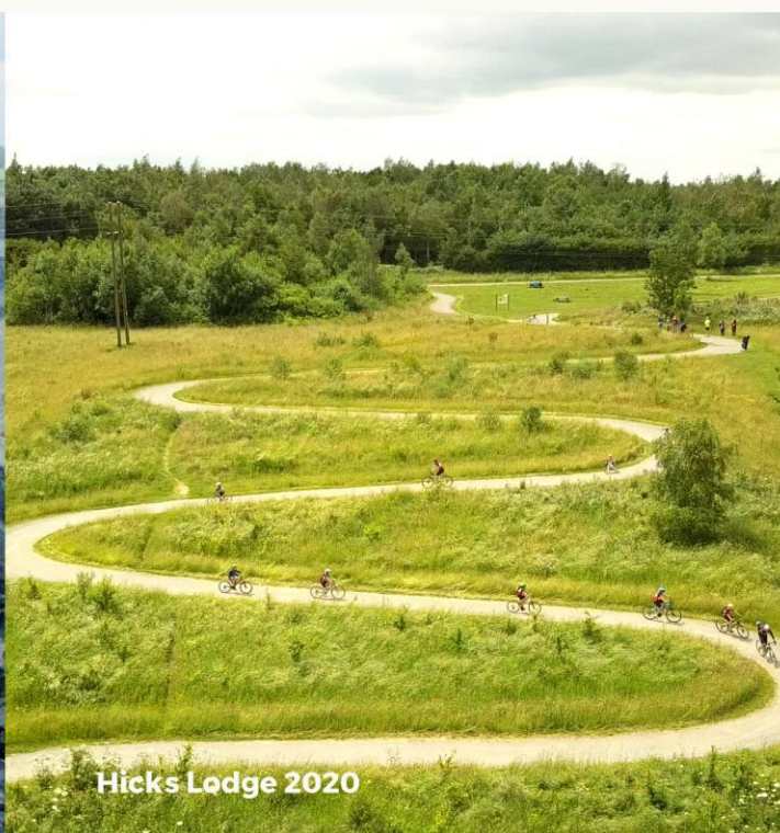
Hicks Lodge 2020