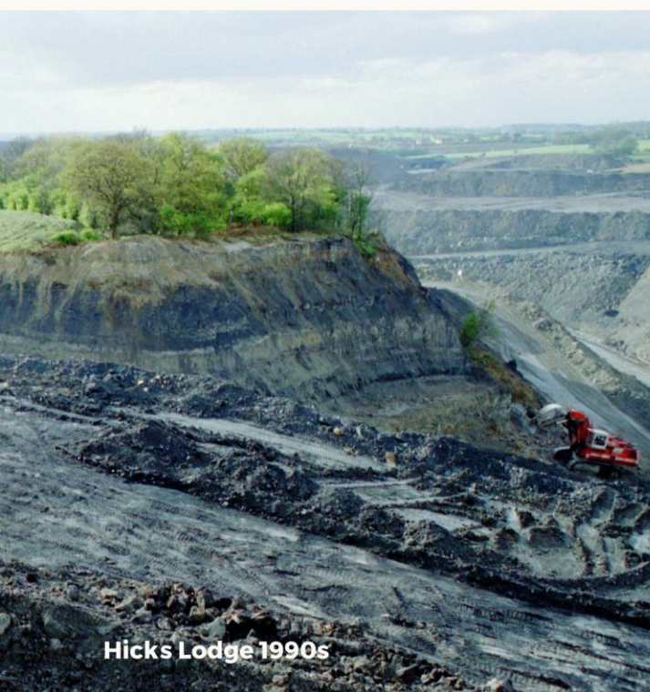
Hicks Lodge 1990s