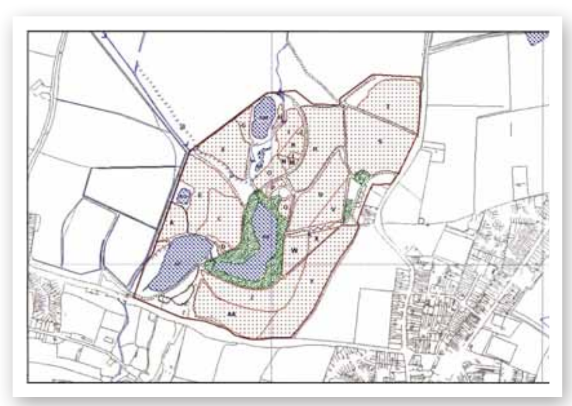
Map of habitat compartments at Sence Valley Forest Park