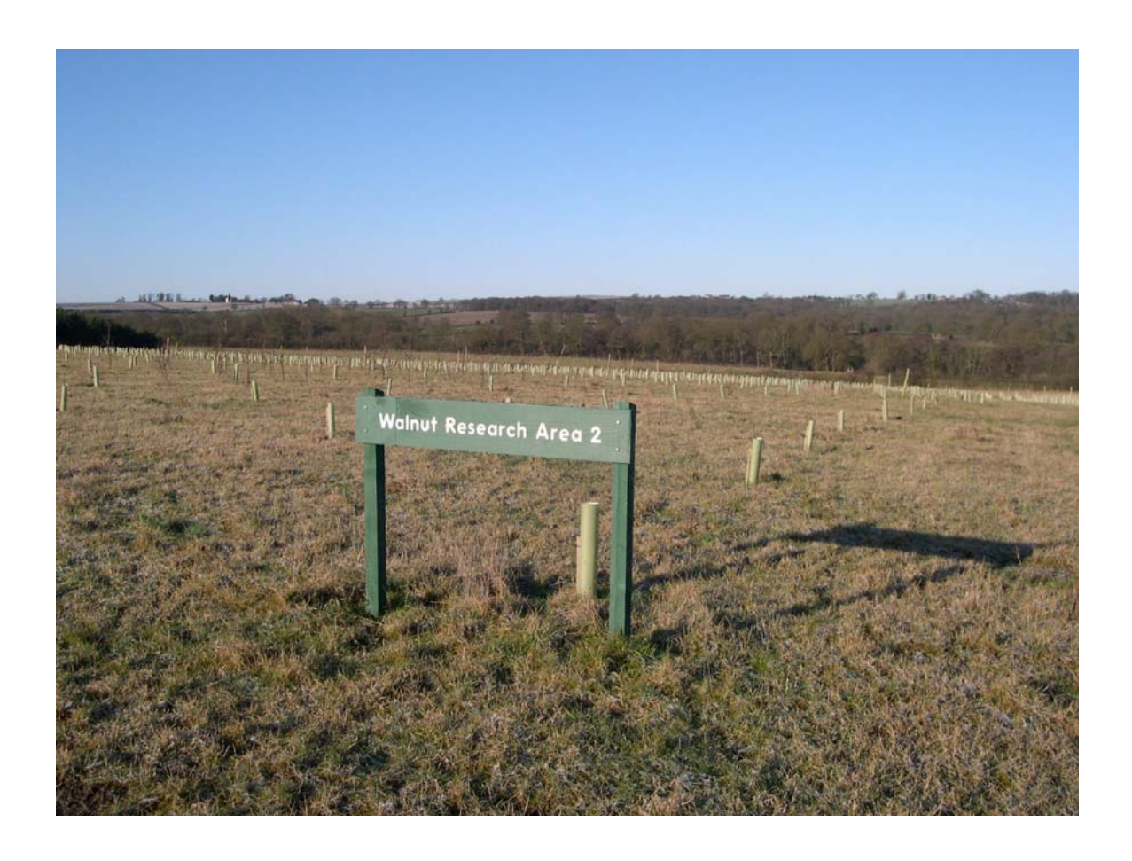
Figure 3. Walnut research trials at Lount.