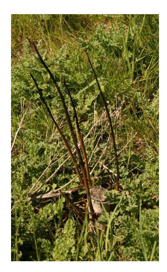
Figure 1. Clockwise from top left: pruned walnut; new shoots arising after winter pruning; deer browse to summer stumping; frost damage to summer stumping.